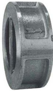
Model 125WCTIB – Cast Iron Body, Bronze Disc Model 125WCTIS – Cast Iron Body, Stainless Steel Disc